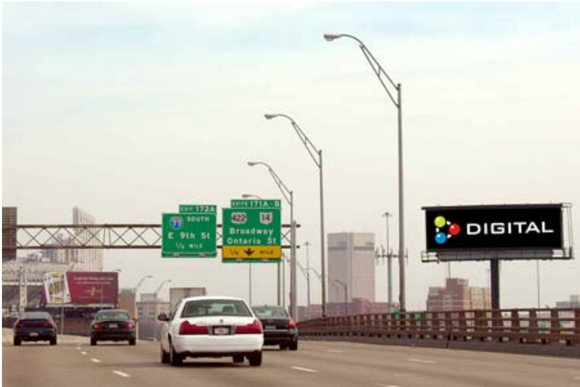
Figure 1. Proximity of EBB #3 to an I-90 interchange. This image shows the same EBB depicted in Figure 2-8, p. 16, of the Tantala study. It is also Site # 22 from the Lee study.

In summary, the researchers' decision to exclude from study crashes that may have been affected by certain "biases" is essentially and critically flawed because it overlooks the most basic understanding of traffic crashes –that they are frequently multi-causal – and it is precisely when such multiple factors are at play – adverse weather, older drivers, complex interchanges, speeding) that the likelihood grows that the cognitive demands on the driver are increased and that irrelevant distraction cannot be tolerated. In other words, one should not exclude such factors because they cause "bias" – these are exactly the factors that interact to increase the likelihood of a crash when other factors such as inattention or distraction are present, and they must be investigated.