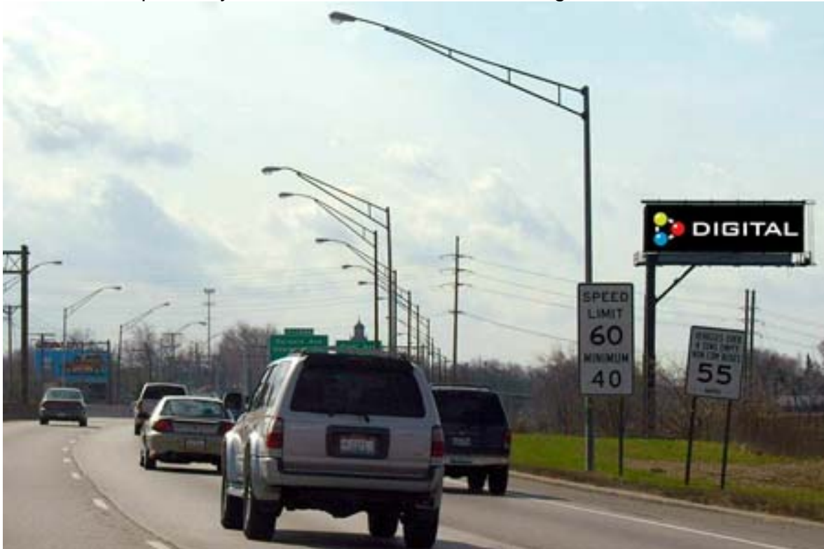
Figure 2. Image showing EBB #4 adjacent to posted Speed Limit signs. This image shows the same EBB depicted in Figure 2-10, p. 17 of the Tantala study. I-77 interchange signs can clearly be seen, as can an additional billboard in the driver's view. This is the same sign represented as Site No. 42 in the Lee report.

this figure clearly shows another billboard within the approaching driver's field of view, and the proximity of this EBB to the I-77 interchange ahead.